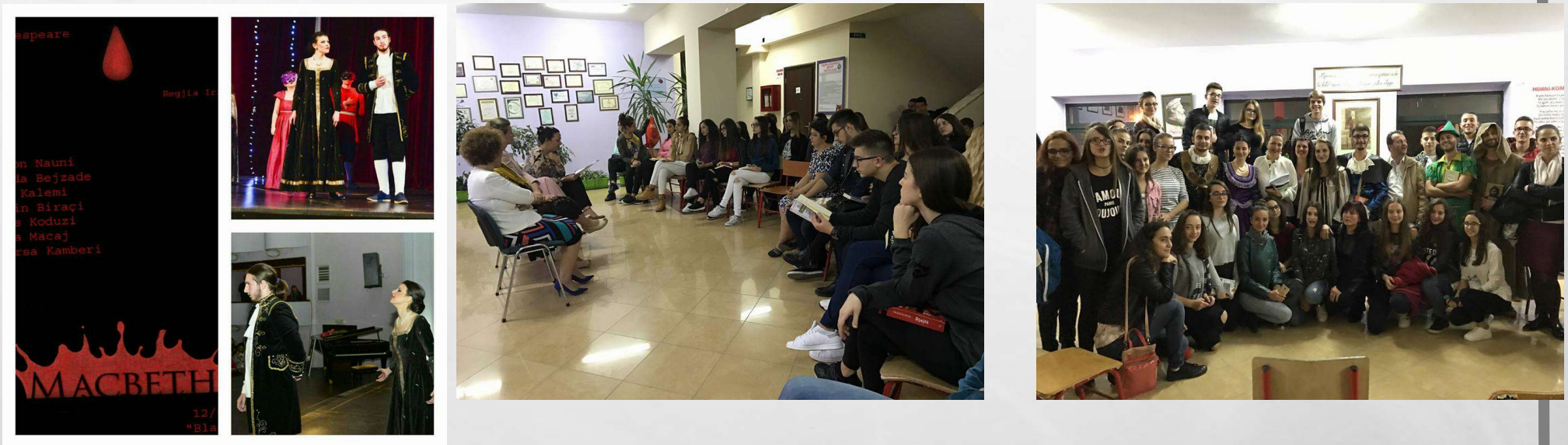
Snapshots from different projects